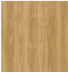
1357 Natural Cherry