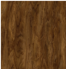
1843 Sienna Walnut