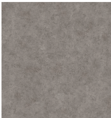
9112 Gray Matter