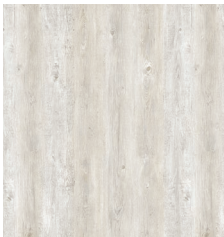
9211 White Pine