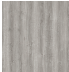
9140 Silver Oak