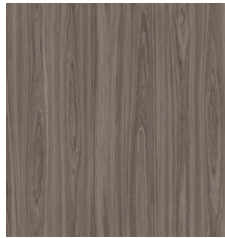
938 Good Gray