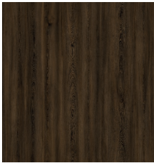
4913 Dark Greige