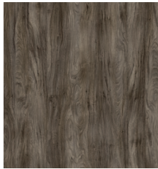
9411 Gray Mahogany