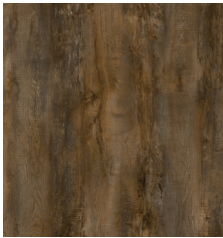
872 Toasted Oak