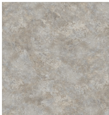
941 Warm Gray