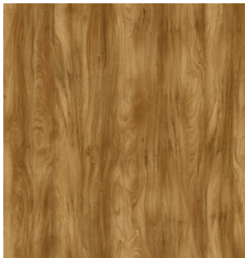
1714 Natural Mahogany