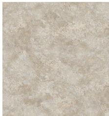
358 Stippled Gray