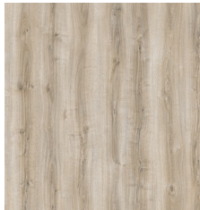
32232 Natural Oak