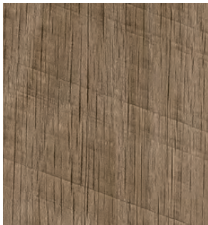
829 Mocha Accent