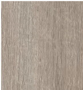
918 Abbey Stone