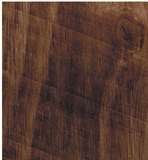
358 Split Rail