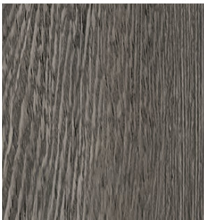
949 Iron Gate