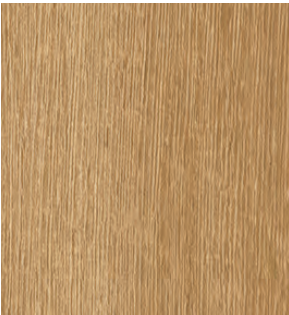
141 Flax Straw