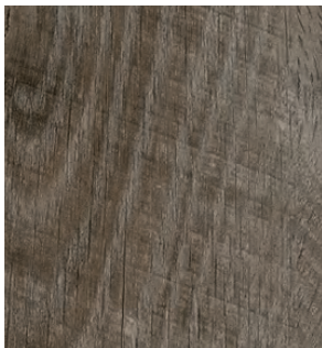
958 Garden Wall