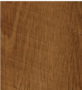
363 Stone Brown