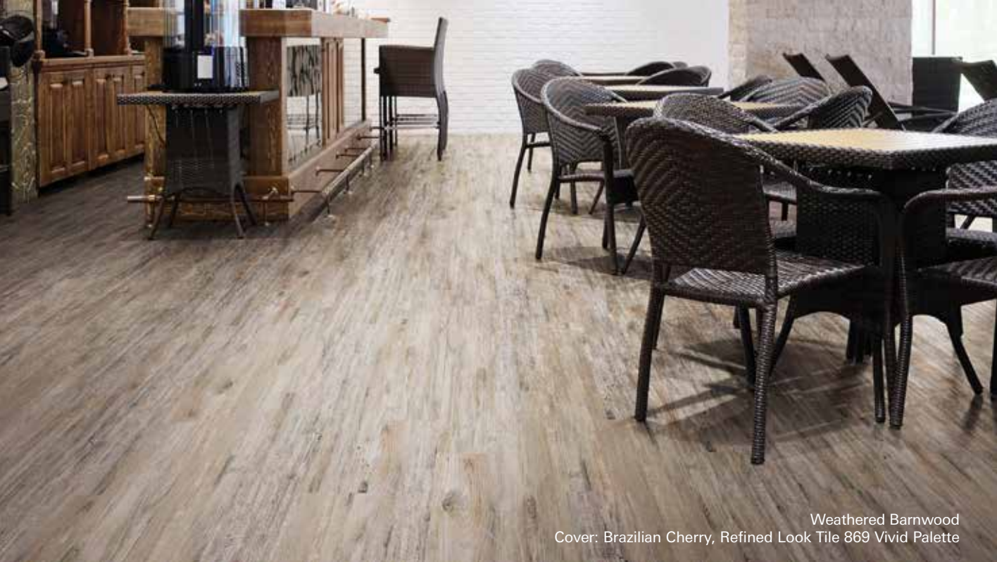
Weathered Barnwood Cover: Brazilian Cherry, Refined Look Tile 869 Vivid Palette