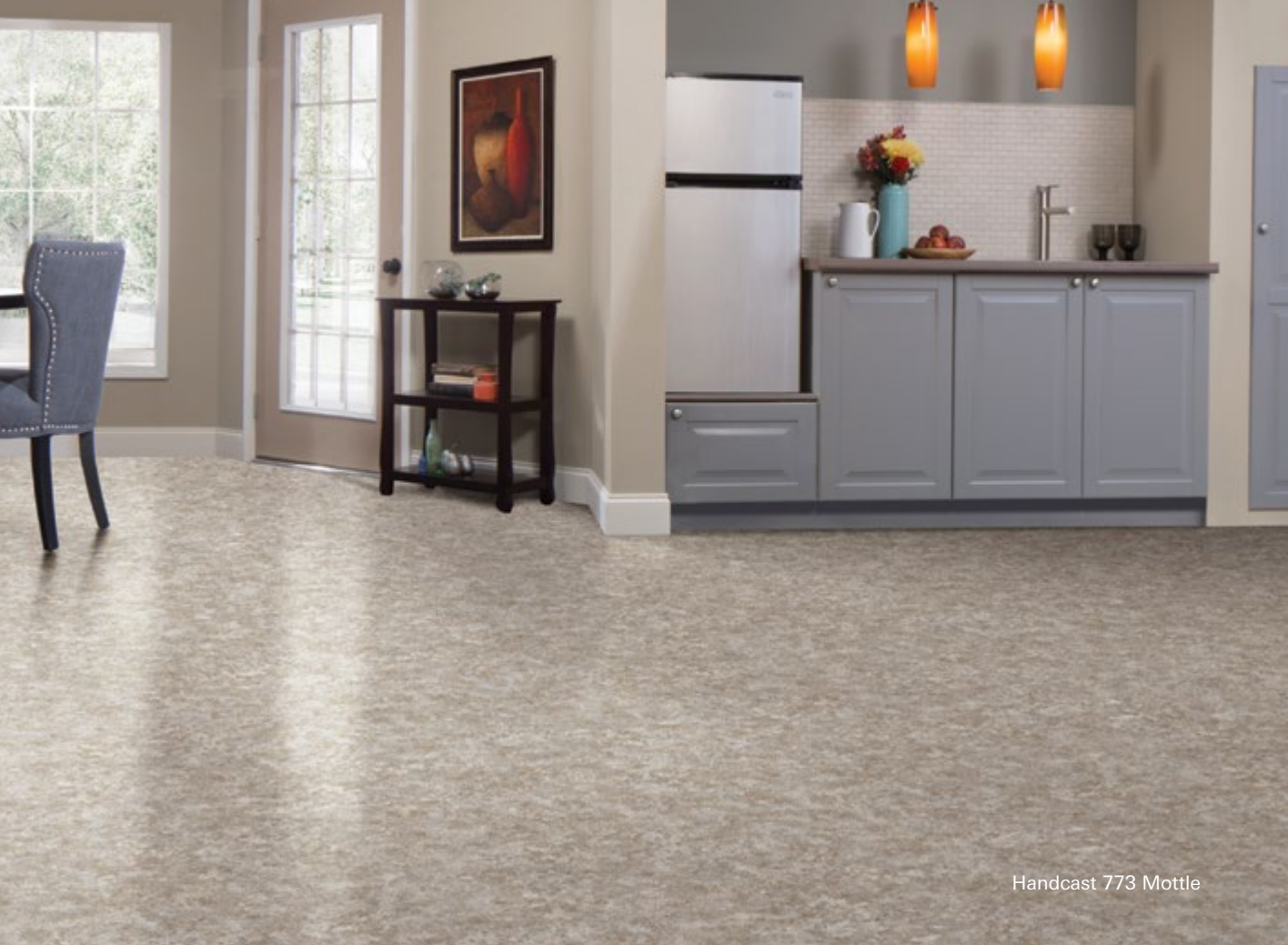
Handcast 773 Mottle