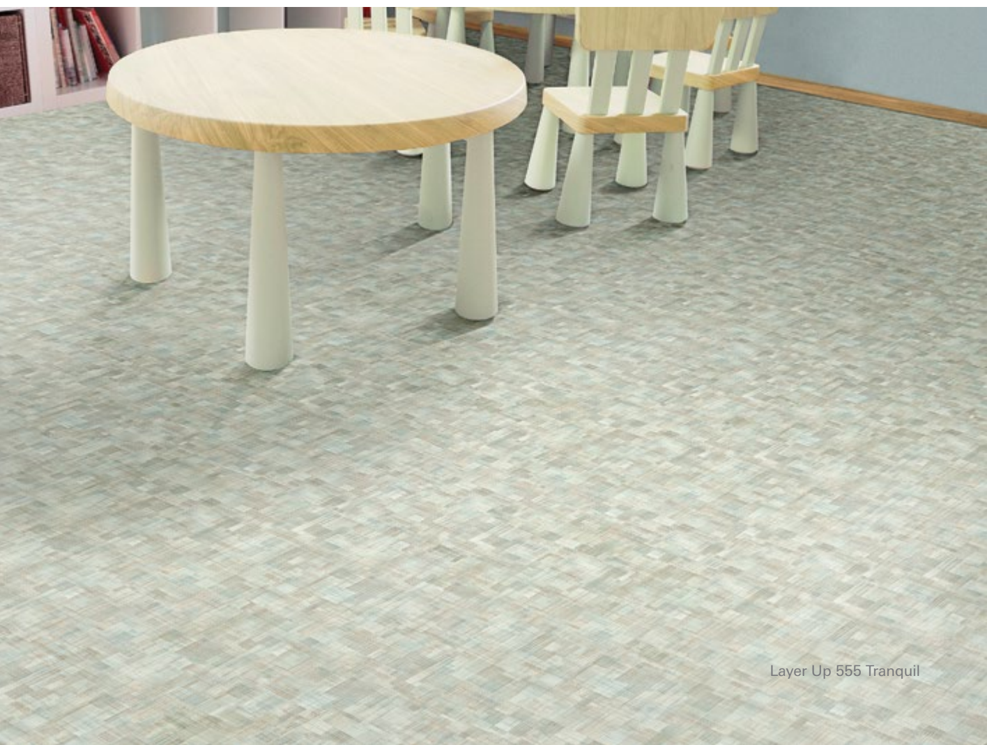
Layer Up 555 Tranquil