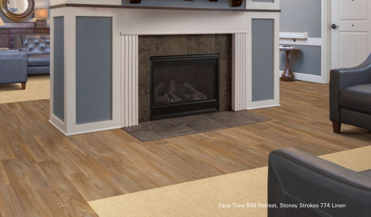
Face Time 848 Retreat, Stoney Strokes 774 Linen