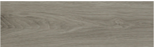
930 Desert Sunset

Note: Halong Bay Collection planks contain different colors and tones within each carton to create unique color play on the floor.