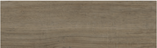
860 Simply Ecu