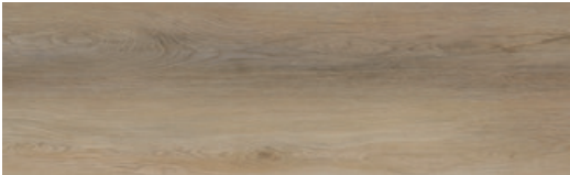
303 Triple Bock