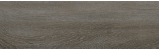
980 Smoked Hiratake