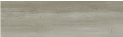
5 Granite Valley