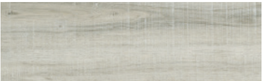
190 Kid Glove