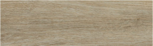
220 Sweeper Beige