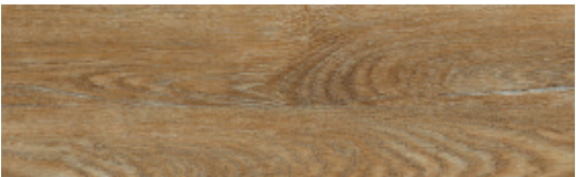
840 Reef Gold