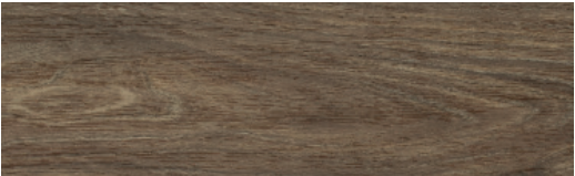
490 Cuppa Joe