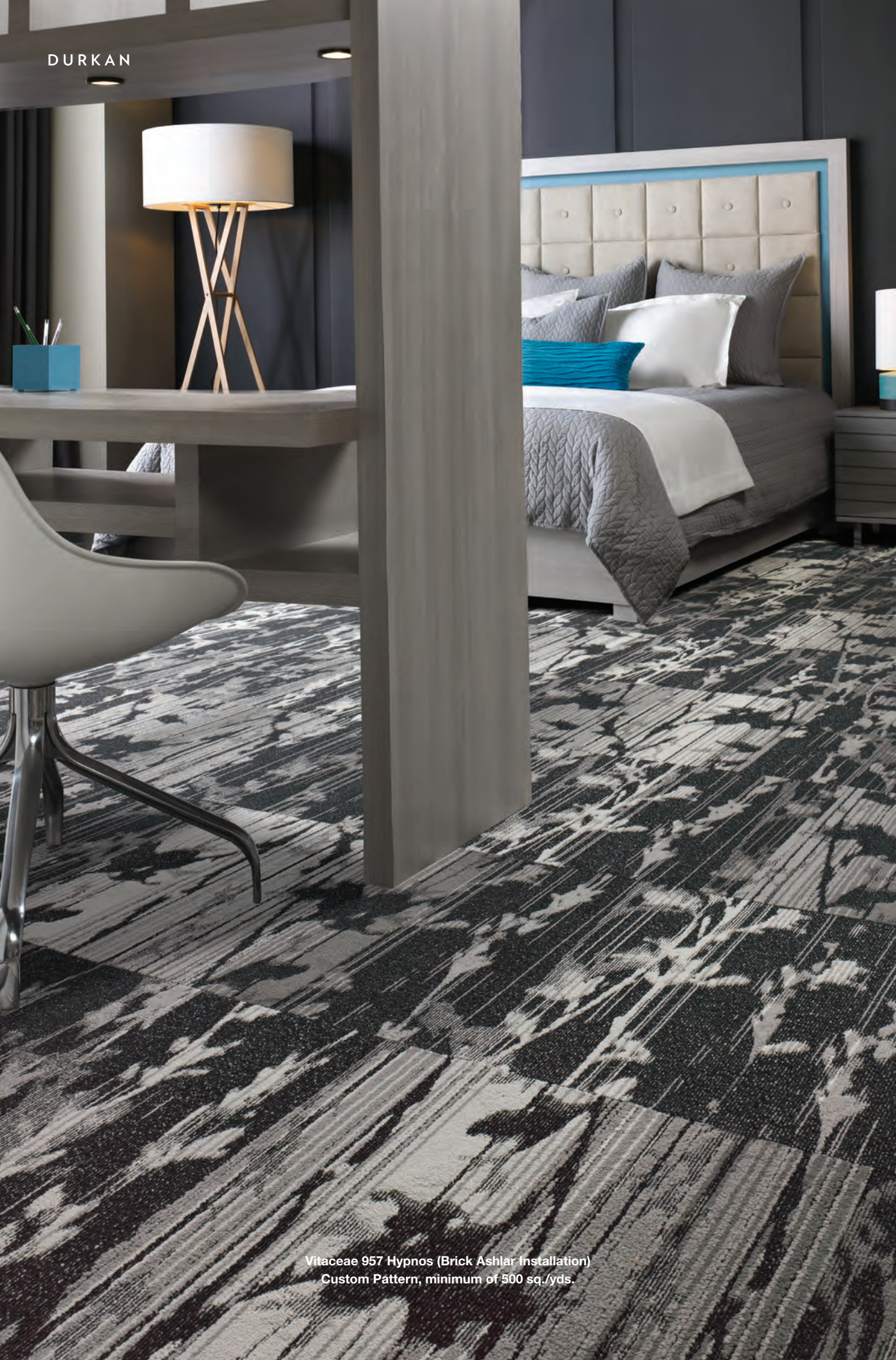
Vitaceae 957 Hypnos (Brick Ashlar Installation) Custom Pattern, minimum of 500 sq./yds.