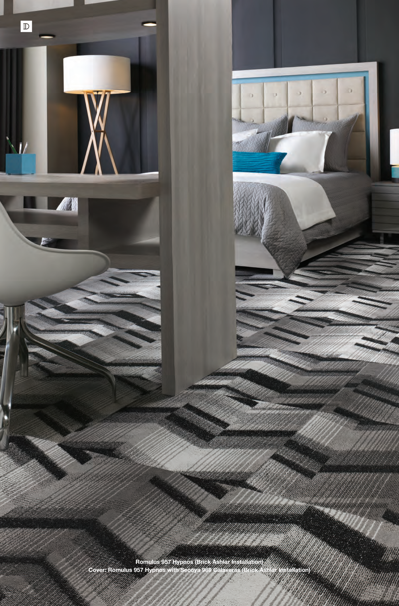
Romulus 957 Hypnós (Brick Ashlar Installation) Cover: Romulus 957 Hypnós with Secoya 989 Calaveras (Brick Ashlar Installation)