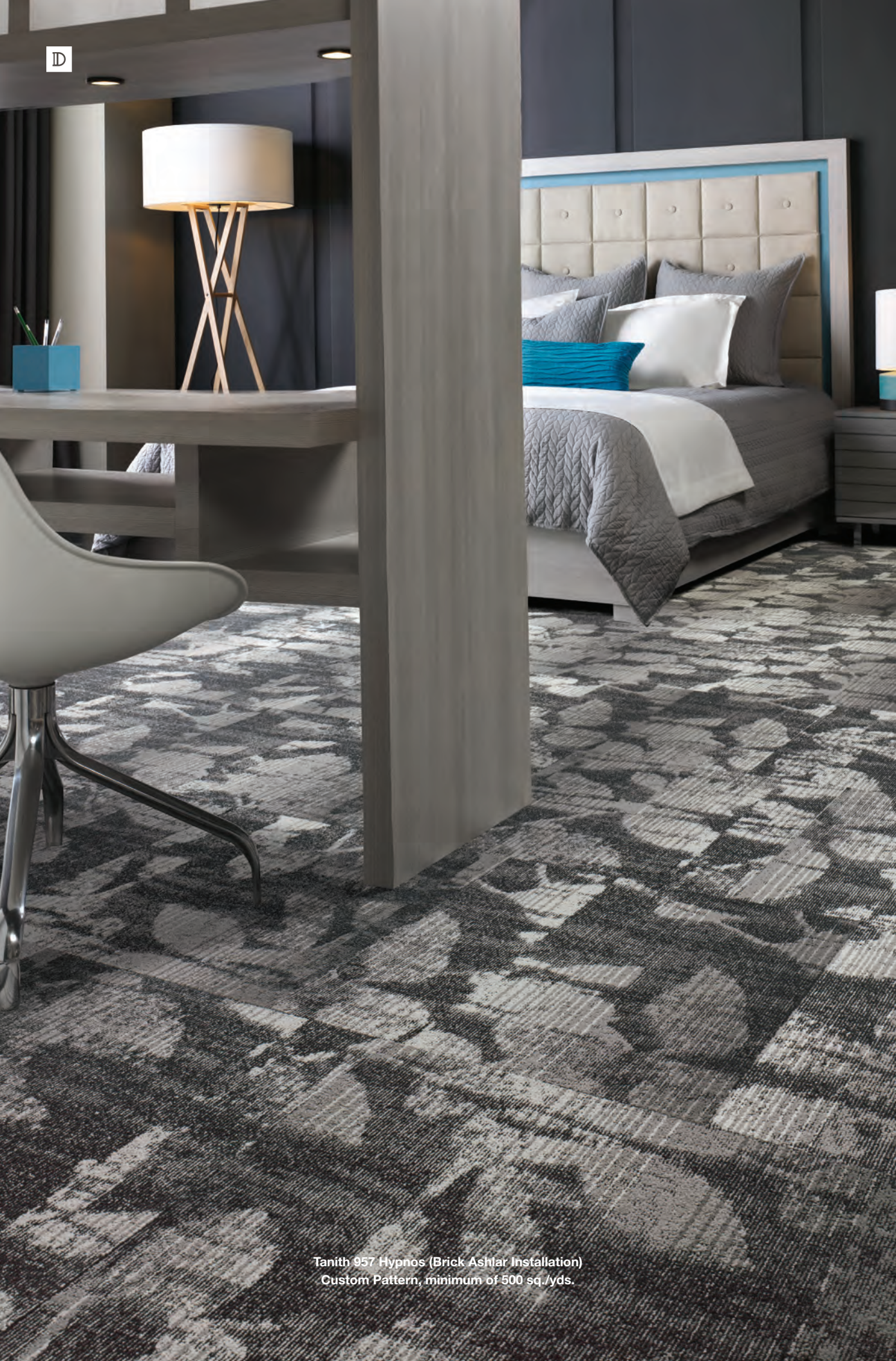
Tanith 957 Hypnos (Brick Ashlar Installation) Custom Pattern, minimum of 500 sq./yds.