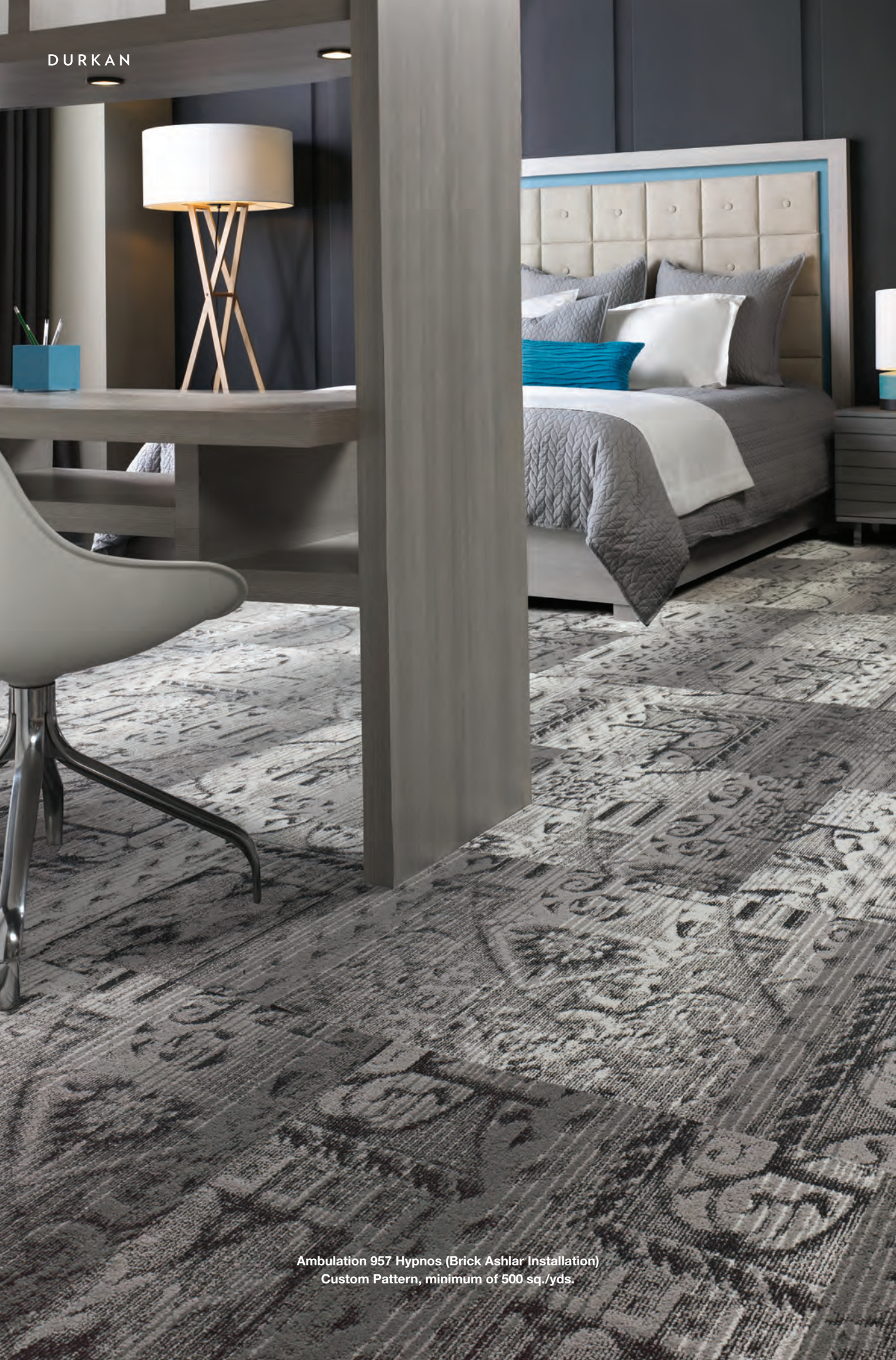
Ambulation 957 Hypnos (Brick Ashlar Installation) Custom Pattern, minimum of 500 sq./yds.