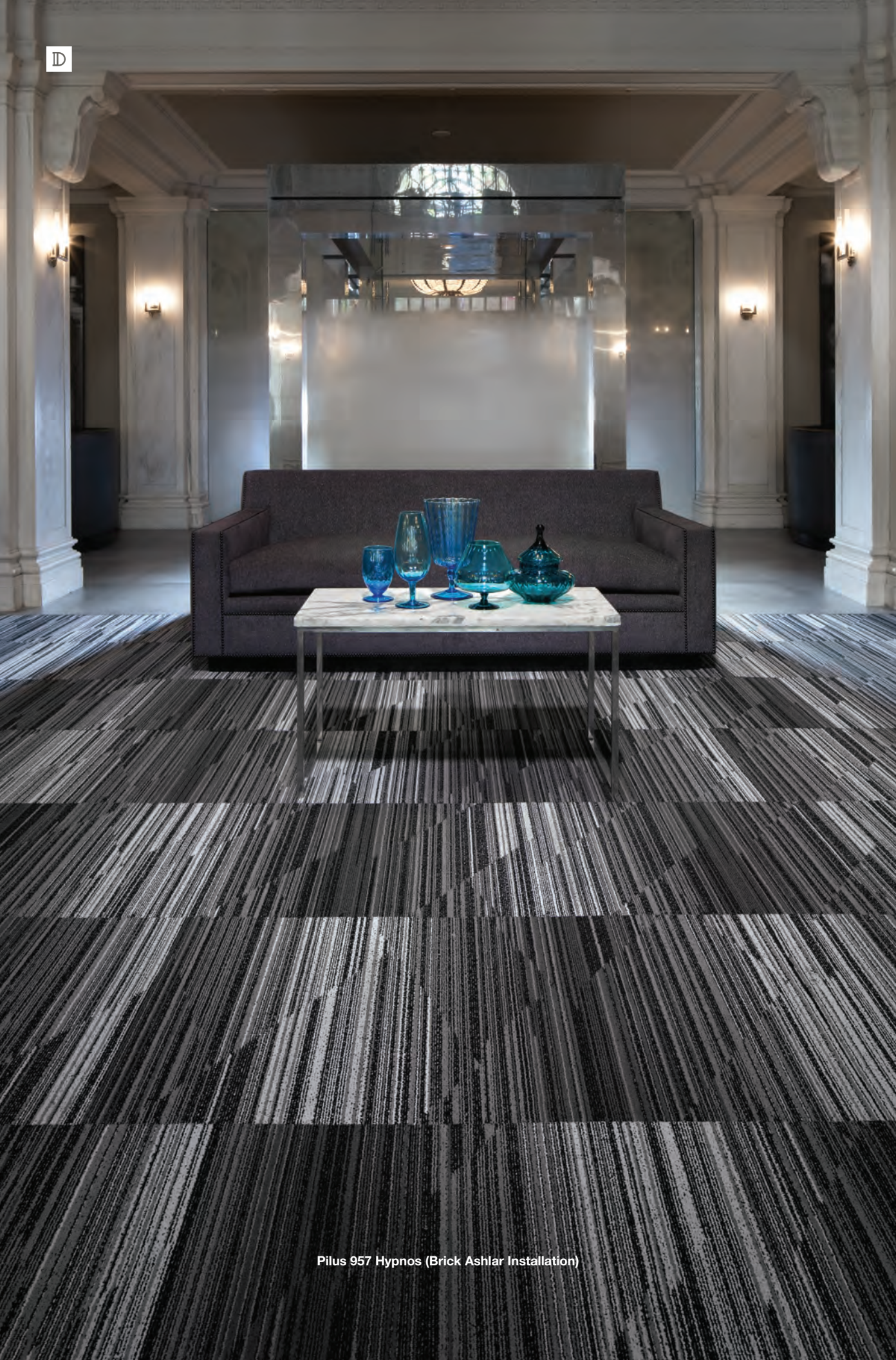
Pilus 957 Hypnos (Brick Ashlar Installation)