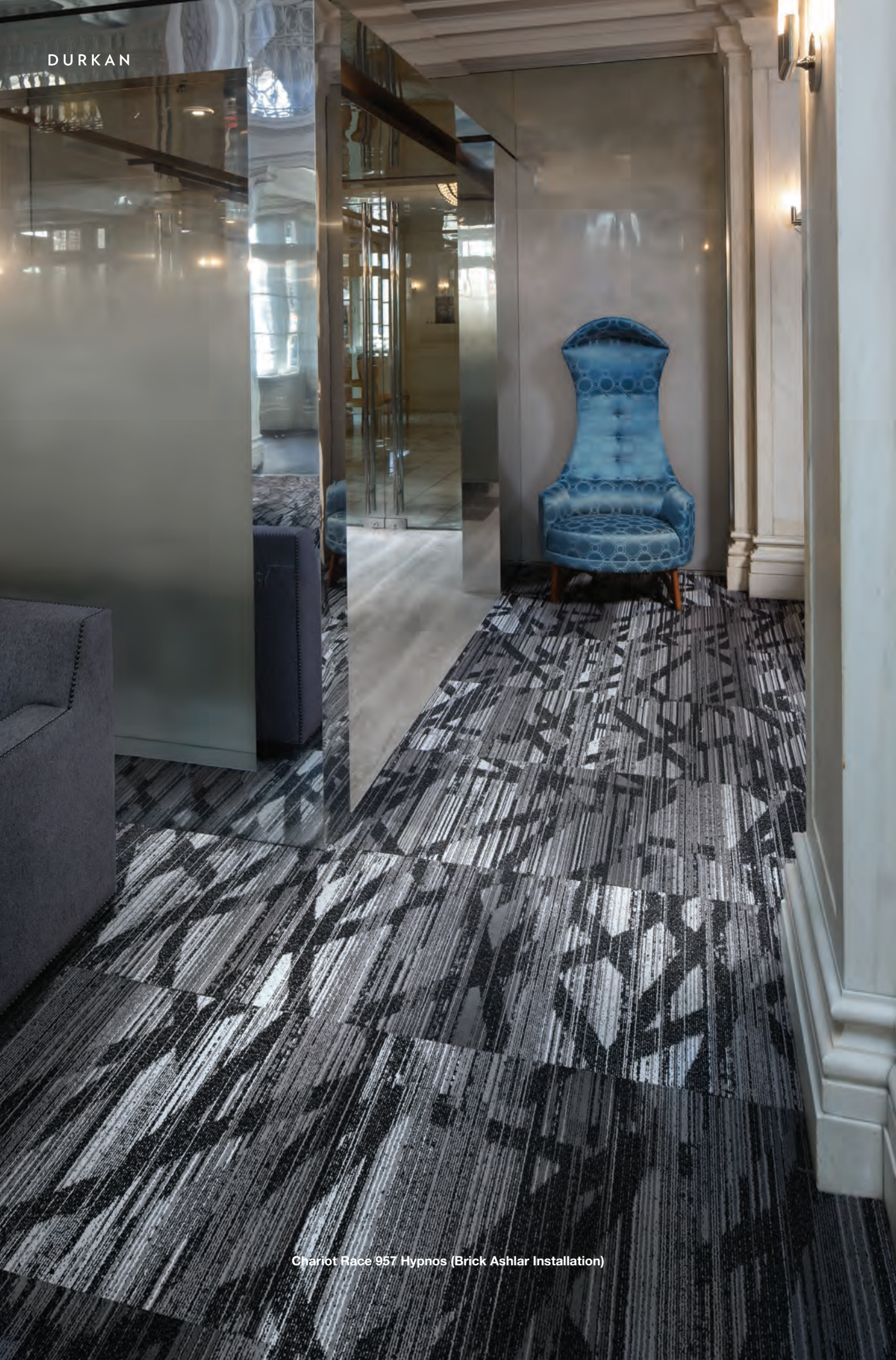
Chariot Race 957 Hypnos (Brick Ashlar Installation)