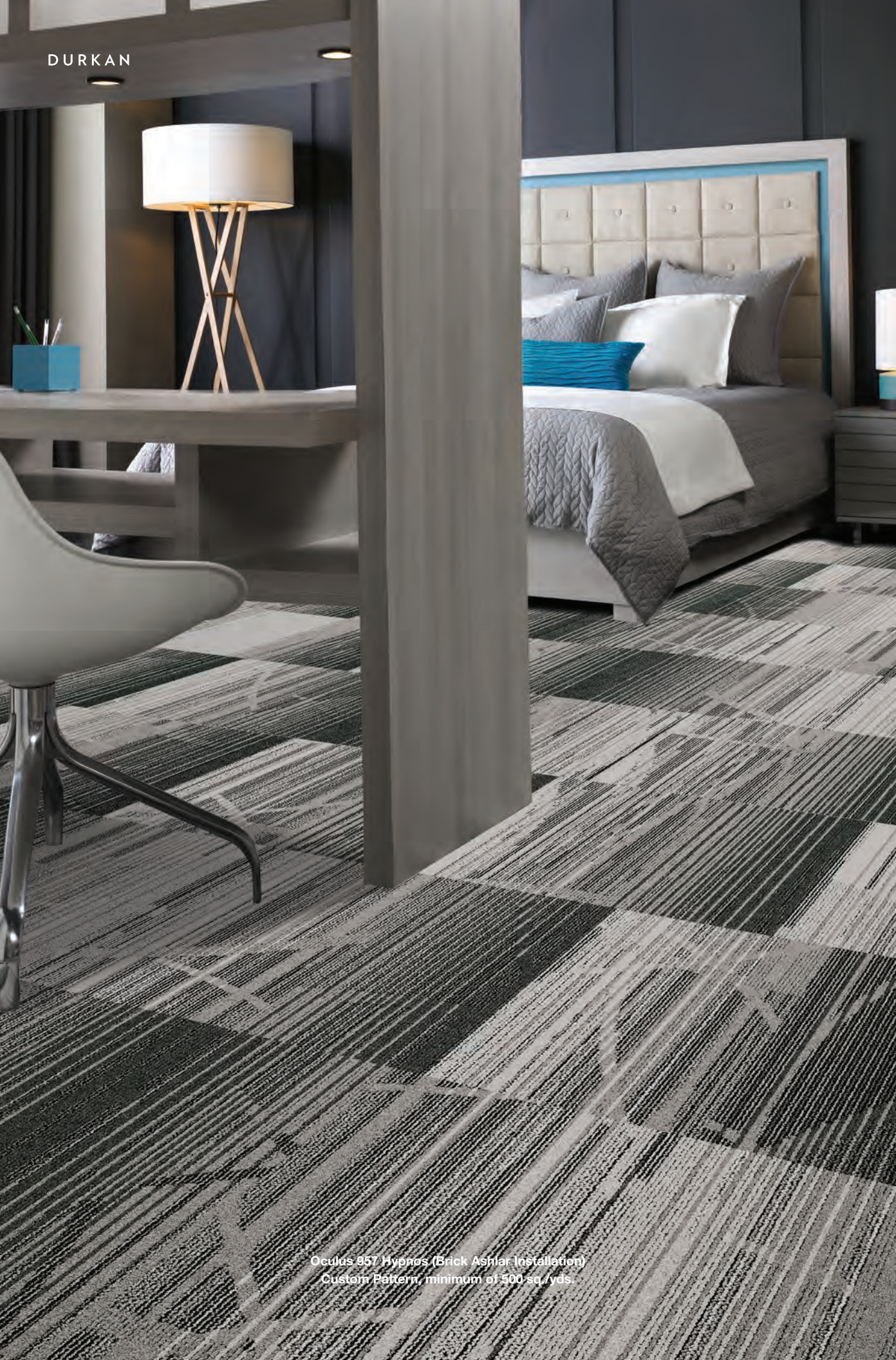
Oculus 957 Hypnos (Brick Ashlar Installation) Custom Pattern, minimum of 500 sq./yds.