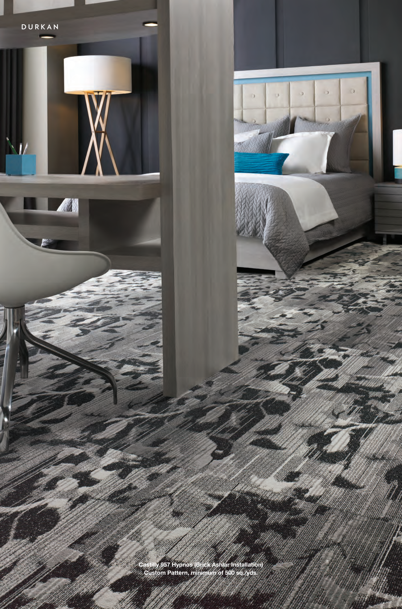
Castilly 957 Hypnos (Brick Ashlar Installation) Custom Pattern, minimum of 500 sq./yds.