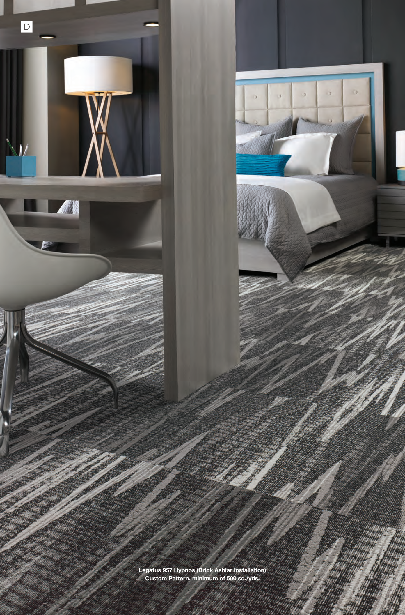
Legatus 957 Hypnos (Brick Ashlar Installation) Custom Pattern, minimum of 500 sq./yds.