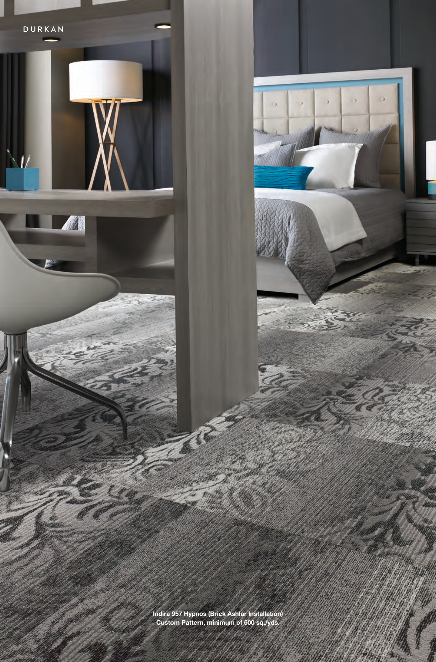
Indira 957 Hypnos (Brick Ashlar Installation) Custom Pattern, minimum of 500 sq./yds.