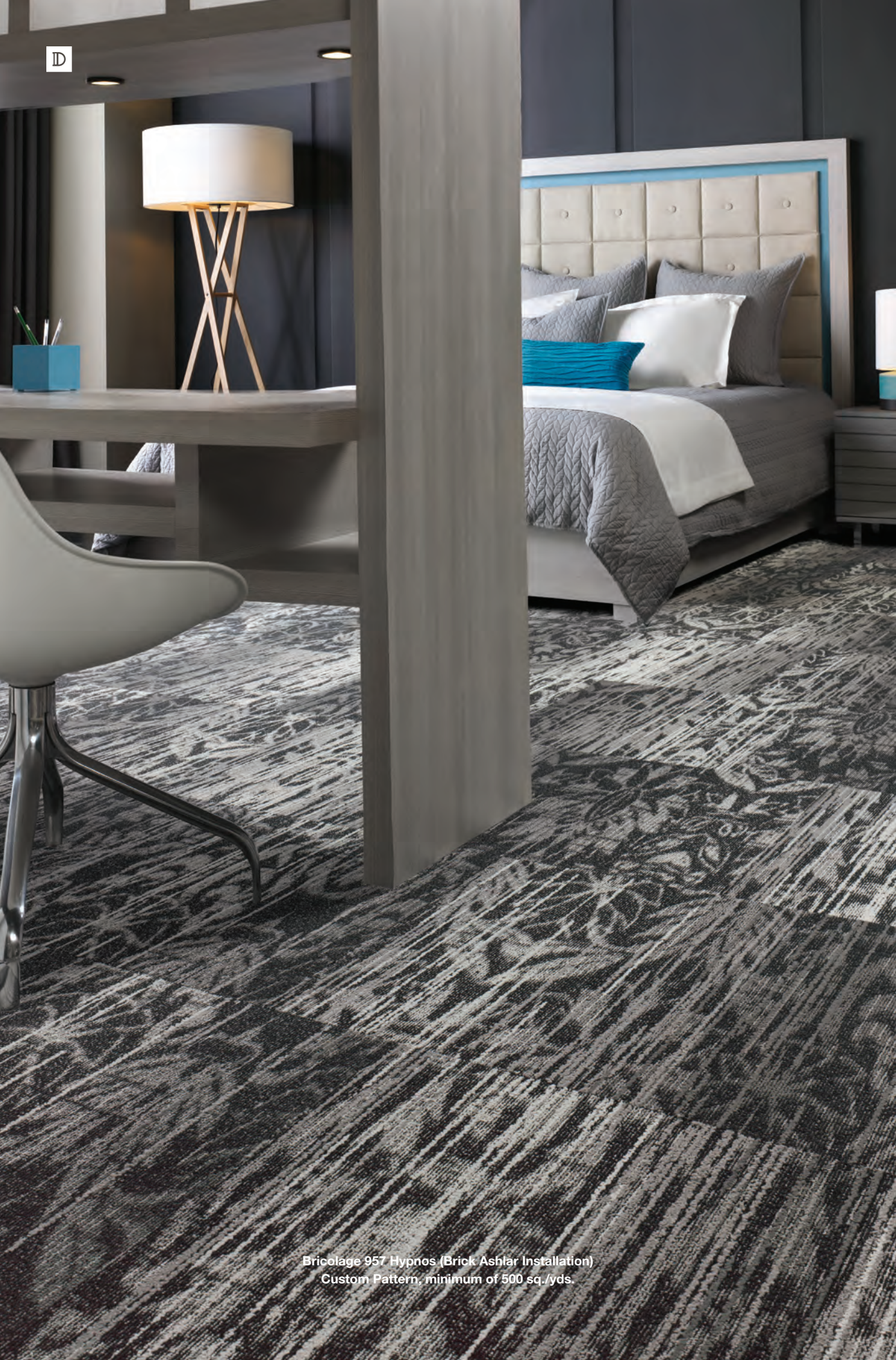
Bricolage 957 Hypnos (Brick Ashlar Installation) Custom Pattern, minimum of 500 sq./yds.