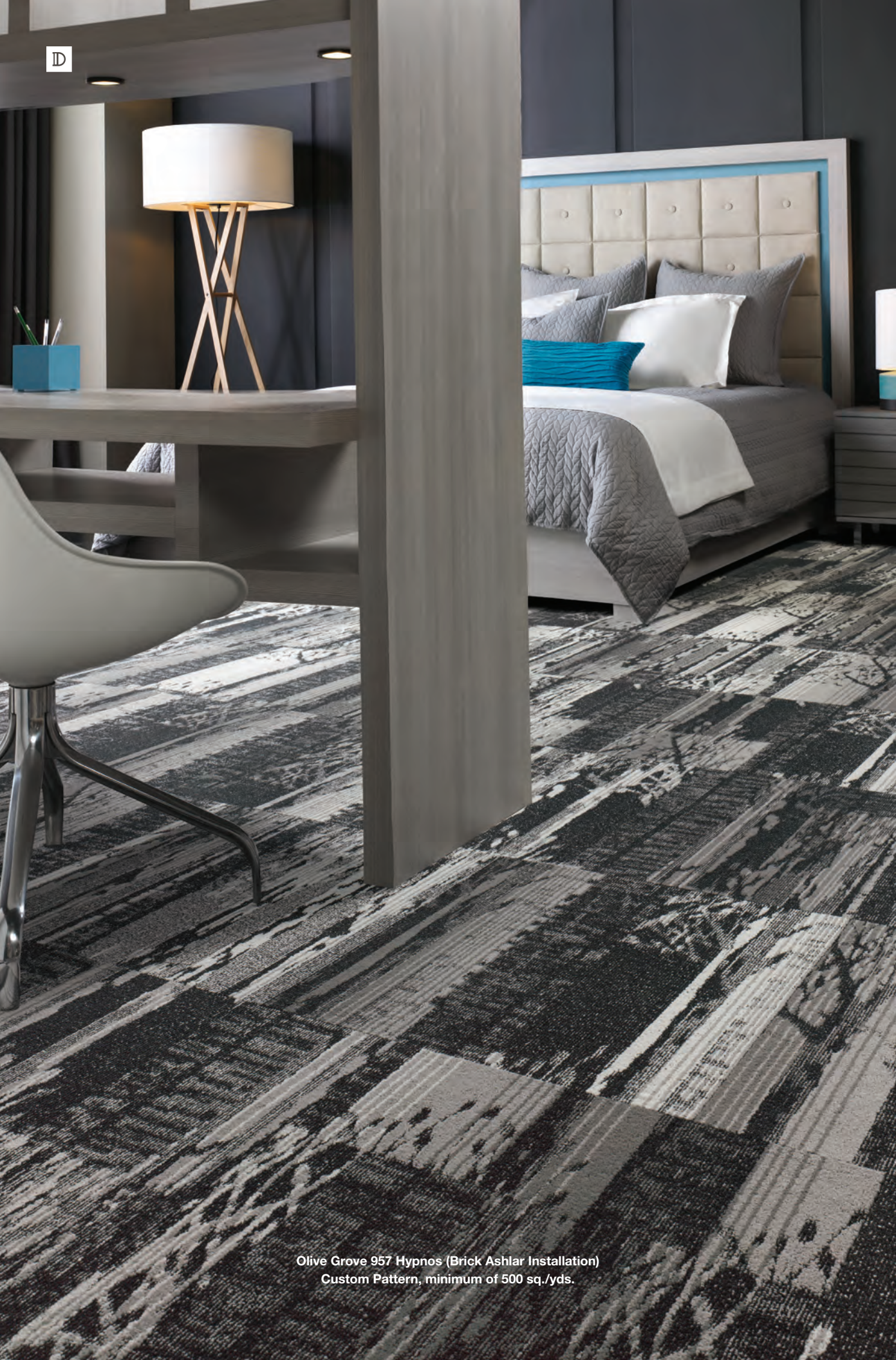
Olive Grove 957 Hypnos (Brick Ashlar Installation) Custom Pattern, minimum of 500 sq./yds.