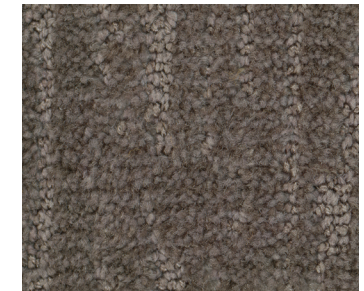
BLEACH with PDI on Chloraguard Enhanced Nylon